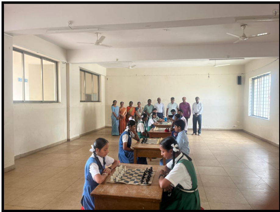
DATE: 29.07.2024, CHESS COMPETITION HELD AT H F KATTIMANI HIGHSCHOOL, HUBBALLI ON OCCASSION OF NATIONAL YOUTH DAY