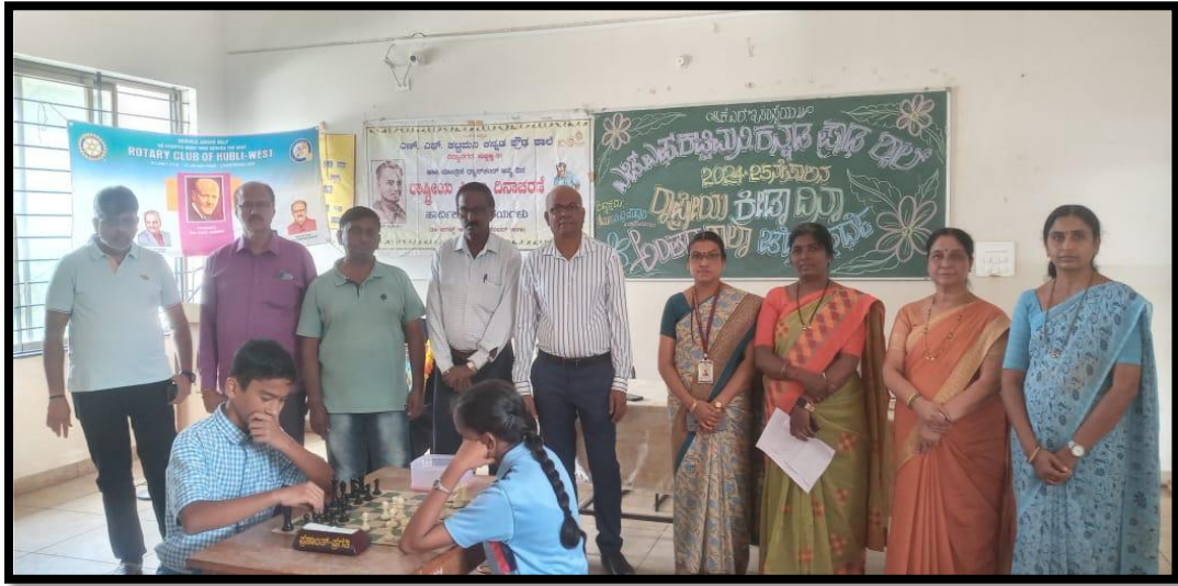
DATE: 29.07.2024, CHESS COMPETITION HELD AT H F KATTIMANI HIGHSCHOOL, HUBBALLI ON OCCASSION OF NATIONAL YOUTH DAY