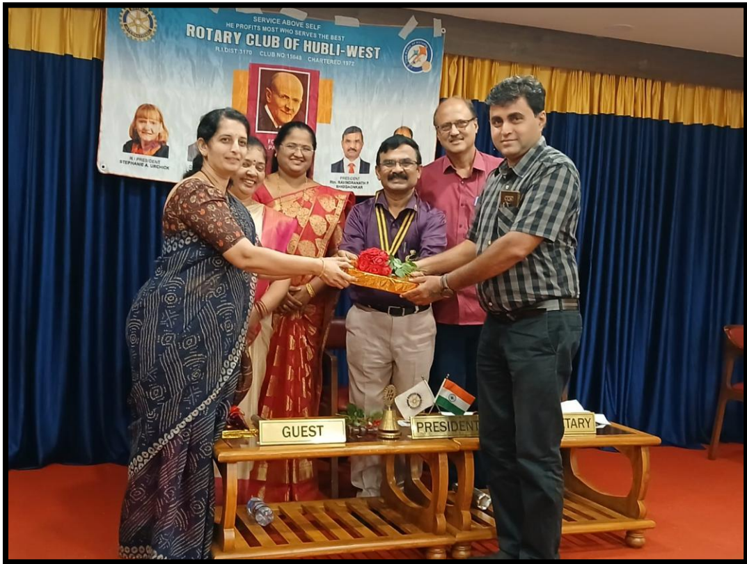
DATE: 31.07.2024, HAPPY MOMENT OF FIRST FAMILY DINNER HELD AT VARAHA BANQUET HALL, OLD HUBLI-UNKAL ROAD, NEAR TATWADARSHA HOSPITAL, HUBBALLI