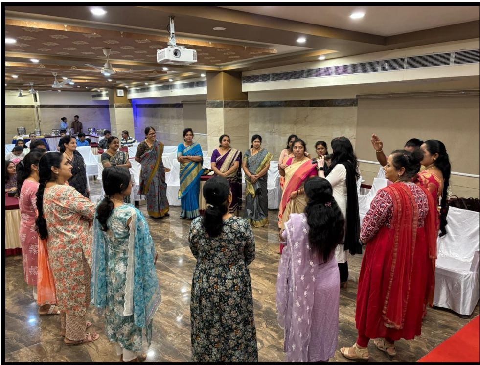
DATE: 31.07.2024, HAPPY MOMENT OF FIRST FAMILY DINNER HELD AT VARAHA BANQUET HALL, OLD HUBLI-UNKAL ROAD, NEAR TATWADARSHA HOSPITAL, HUBBALLI