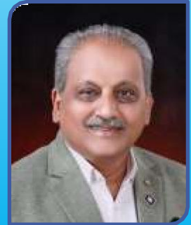
Rtn. Sharad Pai Dist. Governor 3170