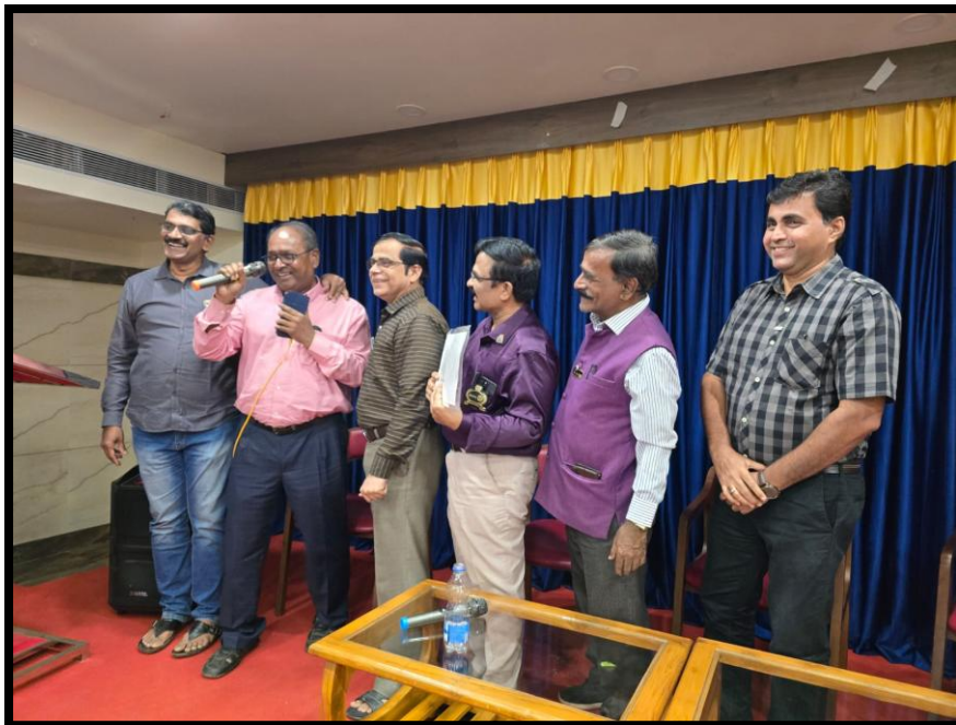
DATE: 31.07.2024, HAPPY MOMENT OF FIRST FAMILY DINNER HELD AT VARAHA BANQUET HALL, OLD HUBLI-UNKAL ROAD, NEAR TATWADARSHA HOSPITAL, HUBBALLI