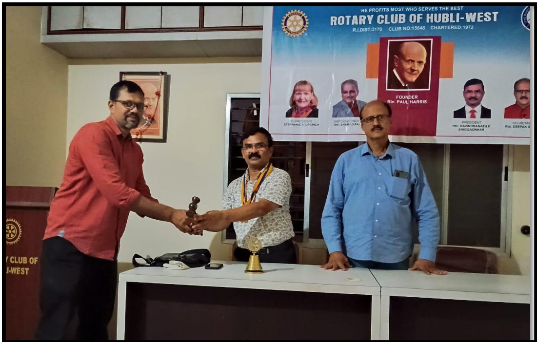
DATE: 16.07.2024, FORTNIGHT MEETING CONDUCTED AT OFFICE, LAXMI COMPLEX, NEELIGIN ROAD, HUBBALLI