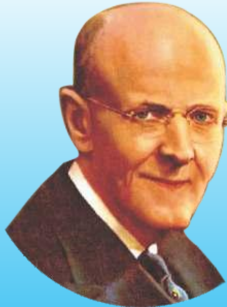
Founder Rtn. Paul P. Harris

R. I. Dist.: 3170 Club No.15648 Chartered: 23-Feb 1972