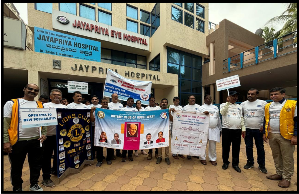
DATE: 31.07.2024, AWARENESS RALLY FOR THE NOBLE CAUSE OF EYE DONATION FROM JAYAPRIYA HOSPITAL. BAILAPPANAVAR NAGAR TO RANI CHANNAMMA CIRCLE