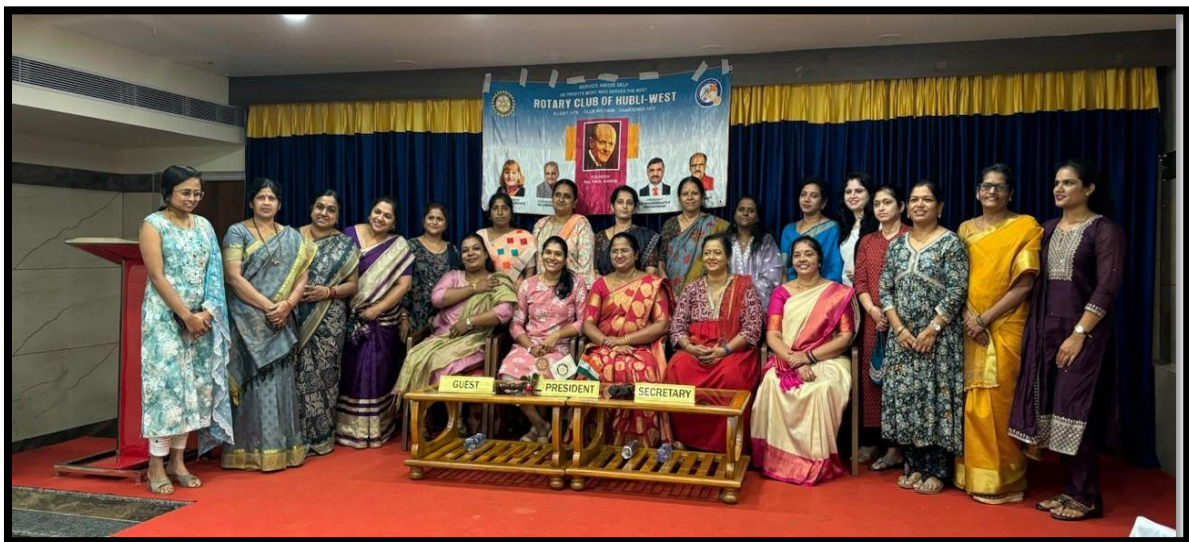
DATE: 31.07.2024, HAPPY MOMENT OF FIRST FAMILY DINNER HELD AT VARAHA BANQUET HALL, OLD HUBLI-UNKAL ROAD, NEAR TATWADARSHA HOSPITAL, HUBBALLI