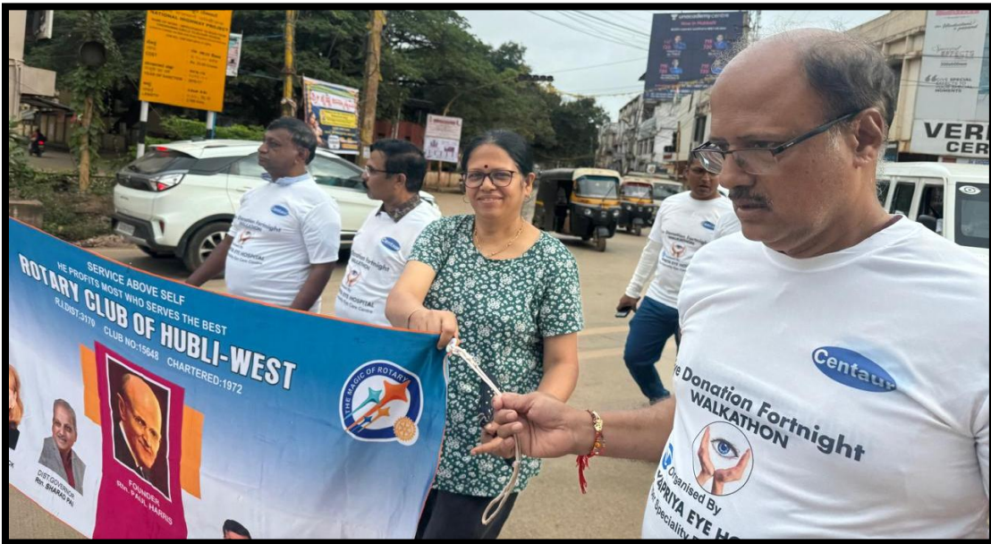
DATE: 31.07.2024, AWARENESS RALLY FOR THE NOBLE CAUSE OF EYE DONATION FROM JAYAPRIYA HOSPITAL. BAILAPPANAVAR NAGAR TO RANI CHANNAMMA CIRCLE