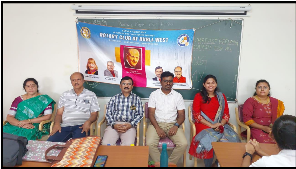
DATE: 05.08.2024 – AWARENESS PROGRAM ON BREASTFEEDING TO KLE NURSING COLLEGE STUDENTS ON THE OCCASION OF BREASTFEEDING WEEK BY THE DOCTORS