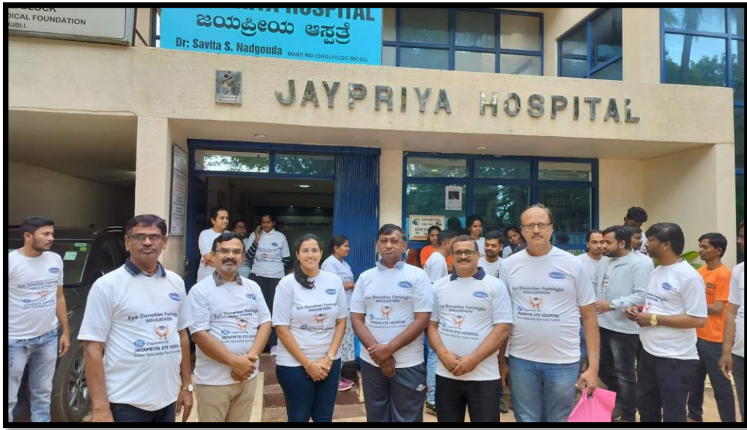
DATE: 31.07.2024, AWARENESS RALLY FOR THE NOBLE CAUSE OF EYE DONATION FROM JAYAPRIYA HOSPITAL. BAILAPPANAVAR NAGAR TO RANI CHANNAMMA CIRCLE