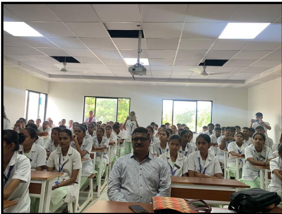
DATE: 05.08.2024 – AWARENESS PROGRAM ON BREASTFEEDING TO KLE NURSING COLLEGE STUDENTS ON THE OCCASION OF BREASTFEEDING WEEK BY THE DOCTORS