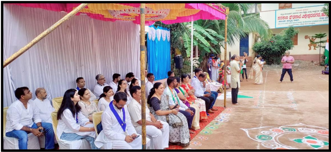
DATE: 15.07.2024, INDEPENDENCE CELEBRATION AT GOVERNMENT HIGHSCHOOL VISHWESHWAR NAGAR, HUBBALLI