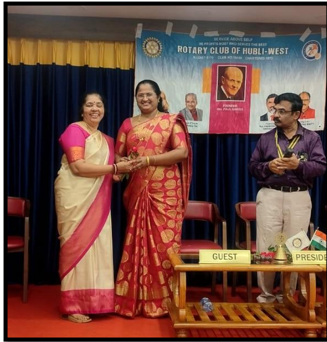
DATE: 31.07.2024, HAPPY MOMENT OF FIRST FAMILY DINNER HELD AT VARAHA BANQUET HALL, OLD HUBLI-UNKAL ROAD, NEAR TATWADARSHA HOSPITAL, HUBBALLI